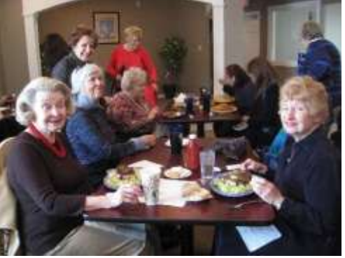
Several WCI EC and other members have Met many of the ladies in this picture seen enjoying their Greek Lunch.

Twenty ladies celebrated International Women's Day at a Greekrestaurant in-